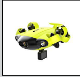
Camera Mount (Bottom)