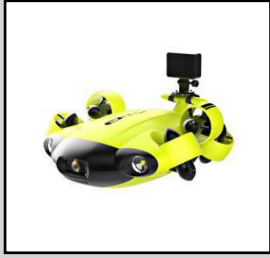
Camera Mount (Upper)