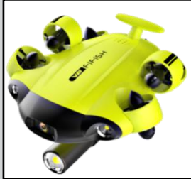
Lighter Mounting Accessory